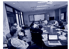
Alpha Brothers in action at their annual summit in NYC.