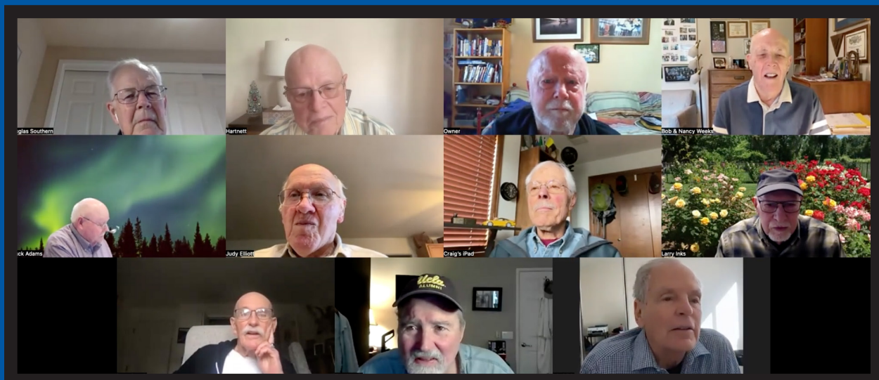
Psi Deuteron Brothers connecting over Zoom. A growing tradition of the group.