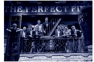
Alpha Brothers post-summit, celebrating a productive day of planning.