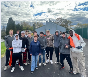
Xi Triton Brothers performing community service in Albany, NY.

Xi Triton (SUNY Albany): Building bonds of Brotherhood meets social media is a theme at Xi Triton. People who are in college today were born with phones in their hands and have been using social media as a way to connect with others. While it does not replace face-to-face connections, the men of Xi Triton have leveraged the power of social media, particularly Instagram, as a starting point for membership recruitment. These men have used Instagram