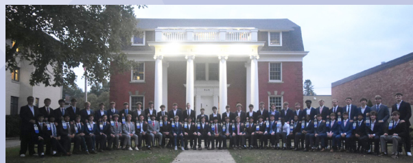
Beta Deuteron Brothers in front of their house on 217 Ash Avenue at the Iowa State University.

Beta Deuteron (Iowa State): Sustainability is a shared goal among the members of this Charge. These guys see passing on the history, traditions, and legacy of their 106 years of existence on the Iowa State Campus as an important feature of their Brotherhood. The Charge targets a yearly recruitment number of approximately 30 new members as a way to sustain membership. They also work to maintain the full group of recruits throughout the entire process. When asked about their recruitment process, they respond that the focus is on being themselves with no pretenses; it's a "what you see is what you get" attitude. They maintain this attitude throughout the New Member process. They attend to the details of the Brotherhood with a strong focus on the Rituals of Theta Delta Chi. They focus on the long history of the Charge and the men who have passed through the doors of the Charge house before them. Brotherhood events are very intentional in focusing on building and maintaining strong relationships with each other. At the weekly Charge meeting, a story or item from past handbooks is brought up and discussed. These activities and this focus on details and relationship building are a living example of a "friendship founded on mutual esteem and dependence."