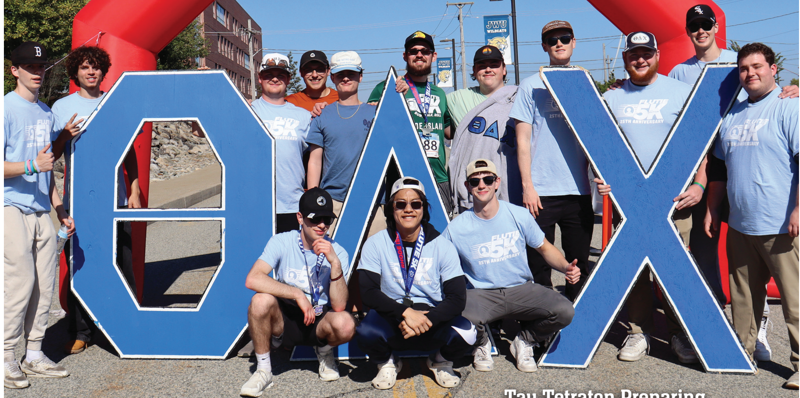
Tau Tetraton Preparing For The Flutie 5k at Johnson & Wales University