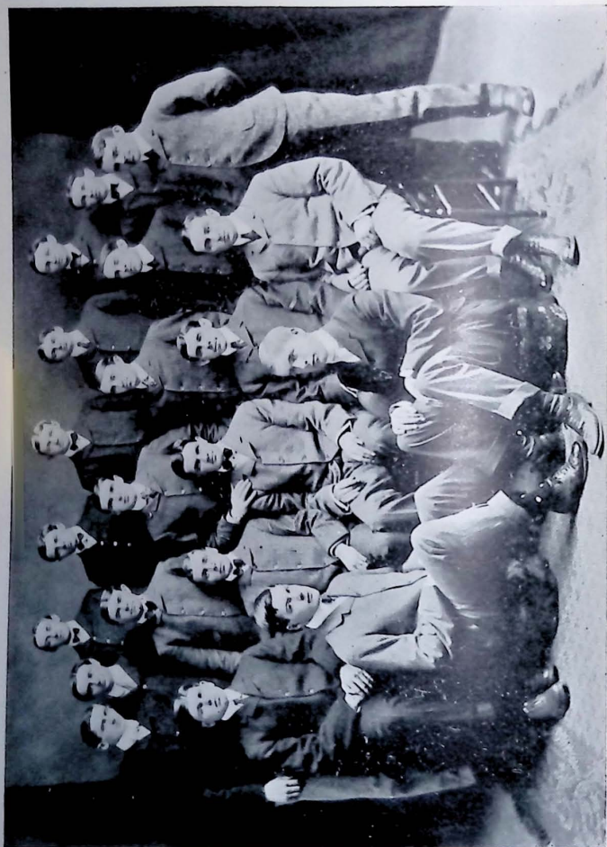
MU DEUTERON CHARGE—1901