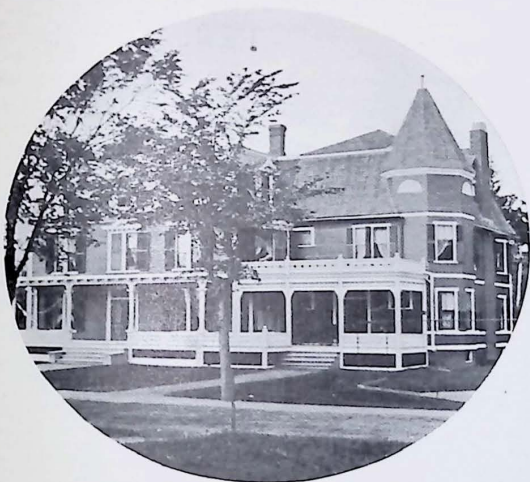
MU DEUTERON CHARGE HOUSE