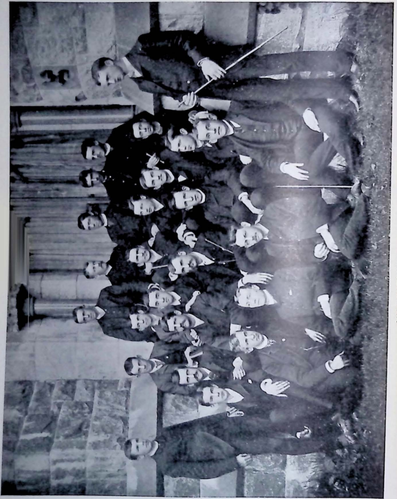
MU DEUTERON CHARGE—1885