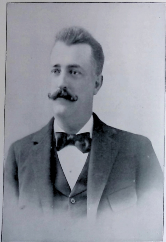
HON. S. FRED NIXON, Psi '81 Speaker of New York Assembly