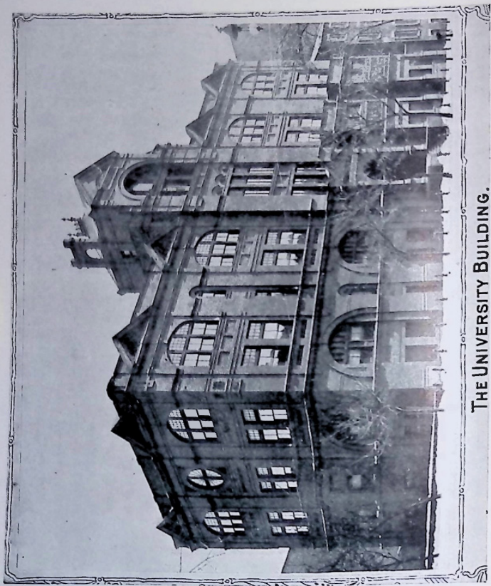
THE UNIVERSITY BUILDING.